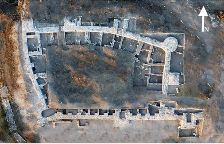
Figure 3 Aerial photograph of the Upper City Citadel trench of Amorium

in the south-west corner of the Upper City. The Inner Wall addition formed a horizontal L shape and abutted the preexisting wall segments and created a roughly rectangular new fortified space with walls as strong as the main city walls. This was not only a space separated from the rest of the Upper City area, but was also very important in terms of being the third and final line of defence for the city.