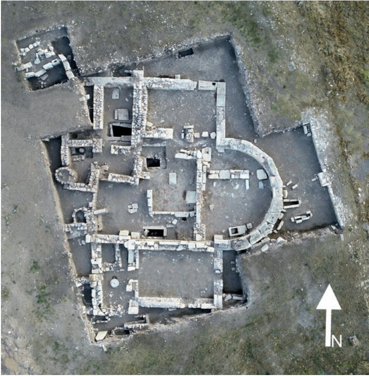
Figure 2 Aerial photograph of Church B trench in the Upper City of Amorium