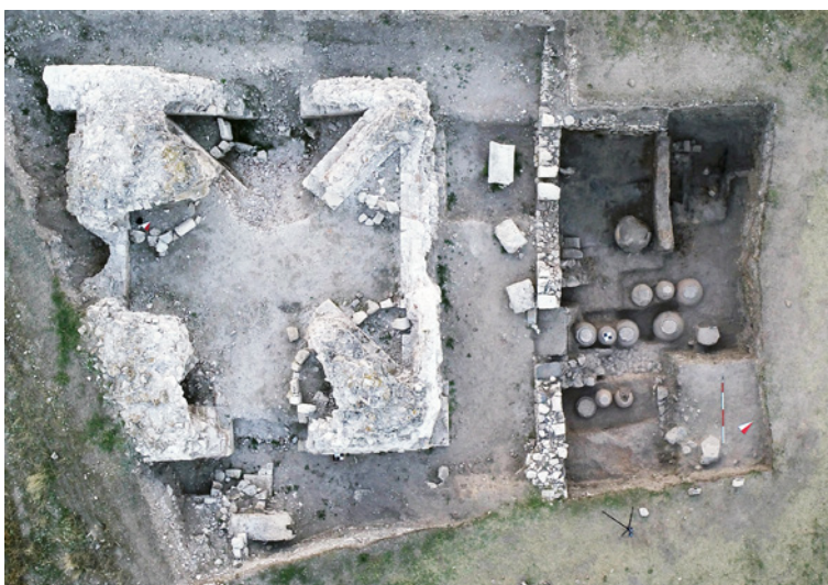
Figure 4 Aerial photograph of the Large Building complex, old (LB) and new (LB/RB) trenches, in the southwestern Lower City of Amorium