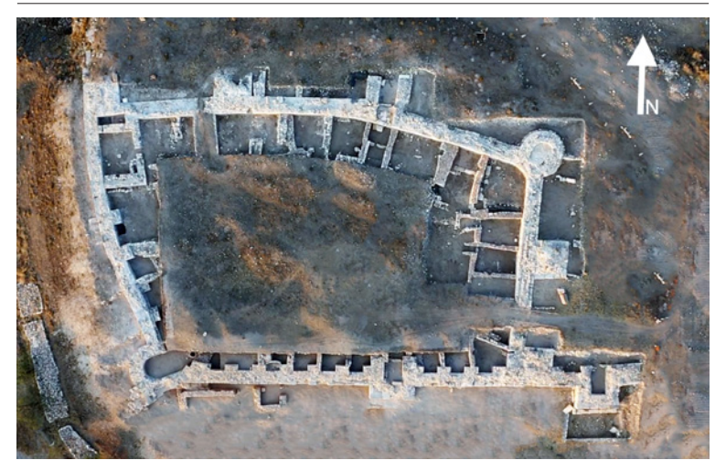
Figure 3 Aerial photograph of the Upper City Citadel trench of Amorium

in the south-west corner of the Upper City. The Inner Wall addition formed a horizontal L shape and abutted the preexisting wall segments and created a roughly rectangular new fortified space with walls as strong as the main city walls. This was not only a space separated from the rest of the Upper City area, but was also very important in terms of being the third and final line of defence for the city.