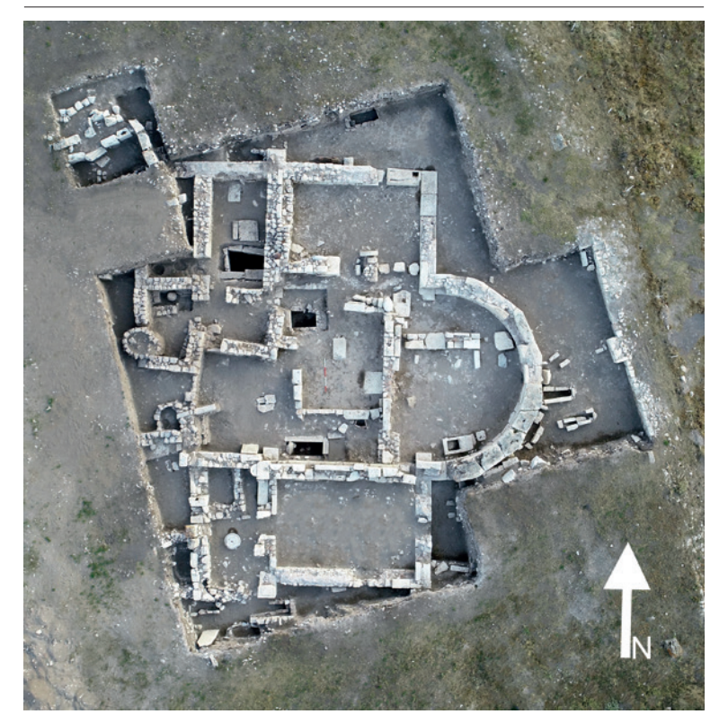
Figure 2 Aerial photograph of Church B trench in the Upper City of Amorium