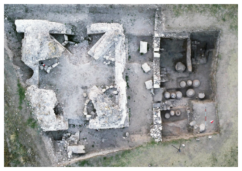
Figure 4 Aerial photograph of the Large Building complex, old (LB) and new (LB/RB) trenches, in the southwestern Lower City of Amorium